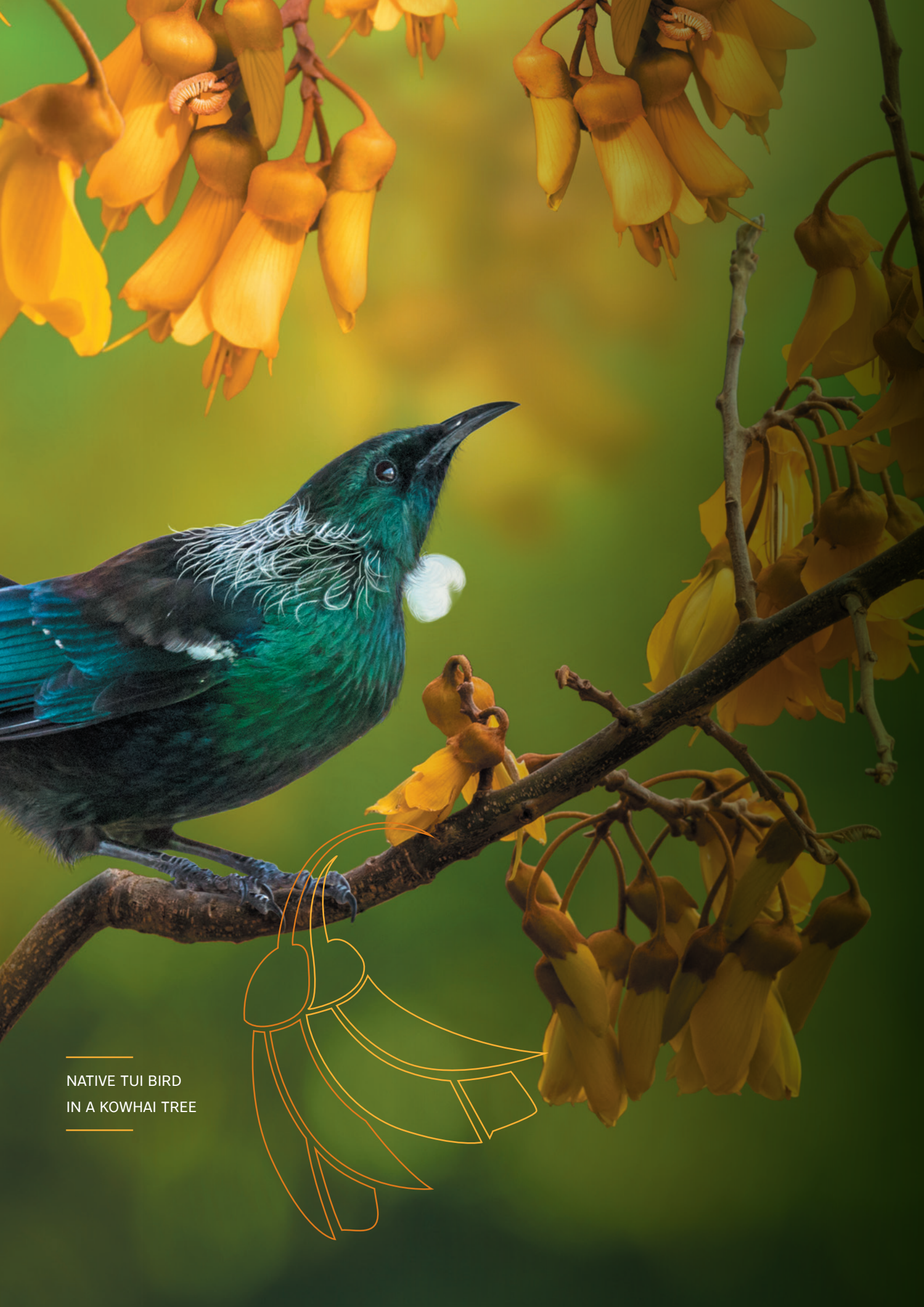
NATIVE TUI BIRD IN A KOWHAI TREE