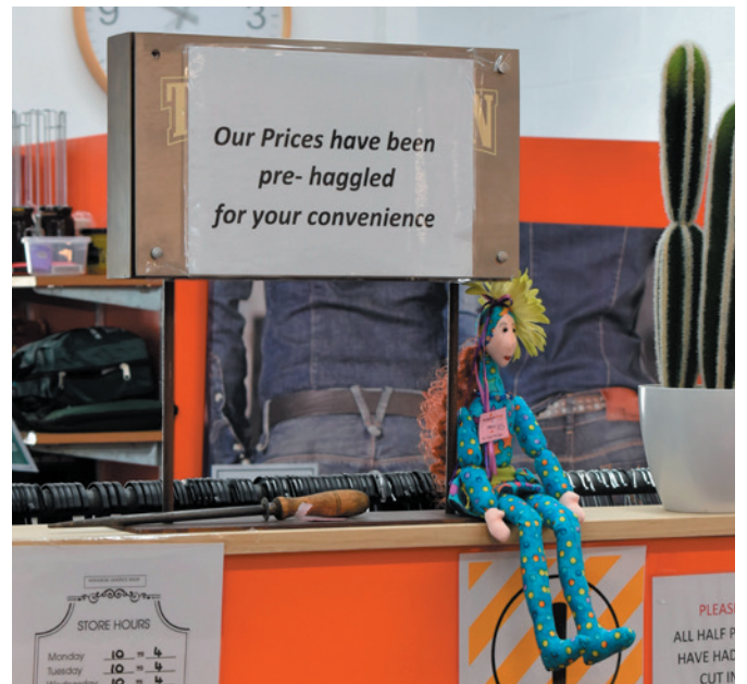
A sign on the counter at Windsor Hospice Shop