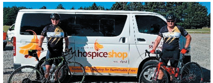
Cyclists on the Rotary Cycle Challenge fundraising event.