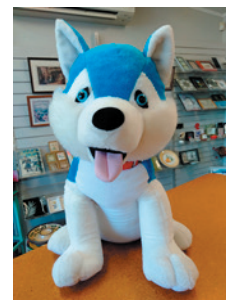
Winton shop mascot Sarge.