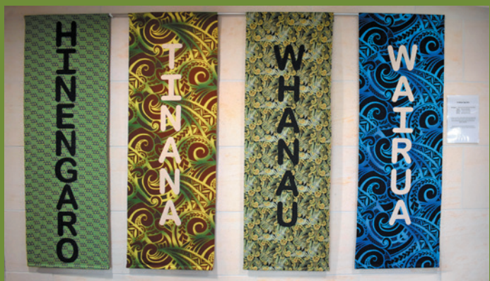
These hanging tapestries in the hospice entrance depict the Te Whare Tapa Whā Maori model of wellbeing.