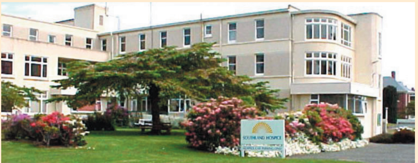
Hospice Southland occupied an old ward in Southland Hospital from 1992 to 2003.

Our motto: ‘Living Every Moment’ is paramount for us.