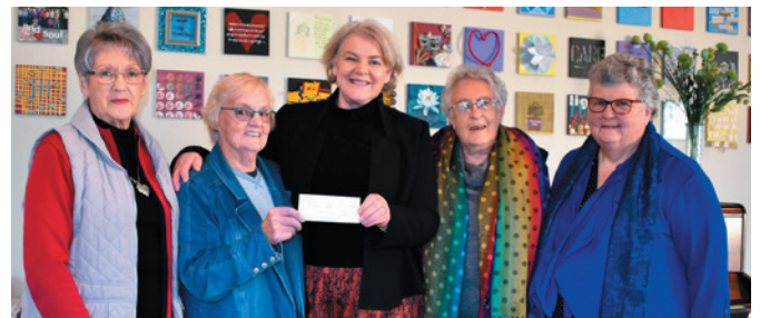
Altrusa Invercargill members present hospice with a $1,000 donation.